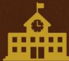
Provision for Pre-school & Nursing Home