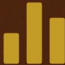
Multiple Plot Sizes Ranging from 210 sq.m to 1007 sq.m

The luxury of owning a piece of land also comes with the luxury of choices. Build a villa with a garden for your grand family, build multiple floors for the future generations, or use it to generate passive income for yourself. With all the modern amenities, this integrated township is completely ready to make your dreams a reality.