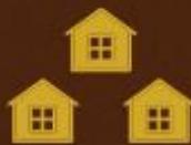
Fully Integrated Township